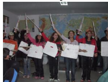
Some of the Székelyhíd youth perform a skit about spiritual armor.

Our next stop on this whirlwind tour was Székelyhíd, Romania. In Székelyhíd we held a three day conference with special sessions for children, youth and adults. We are in awe of the work Gabi Nagy and Eva Kore are doing with the children and youth of Székelyhíd. They and others from the Solymar church in Hungary make several visits each month to teach and strengthen the people there. You should have seen the intense competition and excitement during some "Sword drills" where teams were organized and competed to see which team would be first to find each scripture.