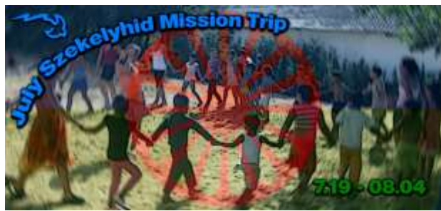
Pray for our team in Szekelyhid, Romania: